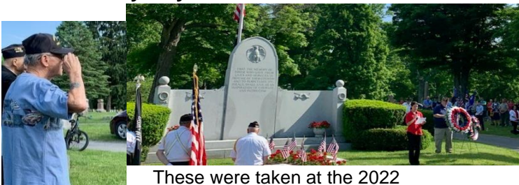
These were taken at the 2022 Memorial Day Parade